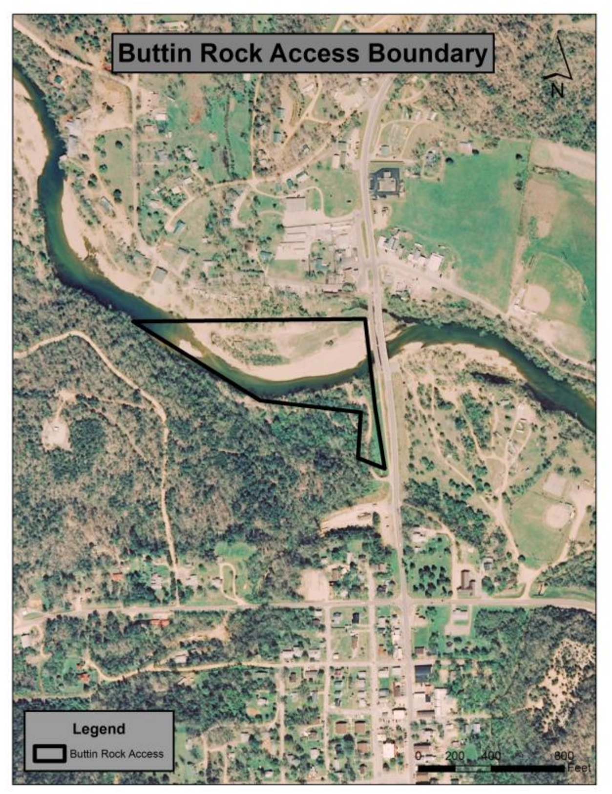
Figure 2: Aerial Map