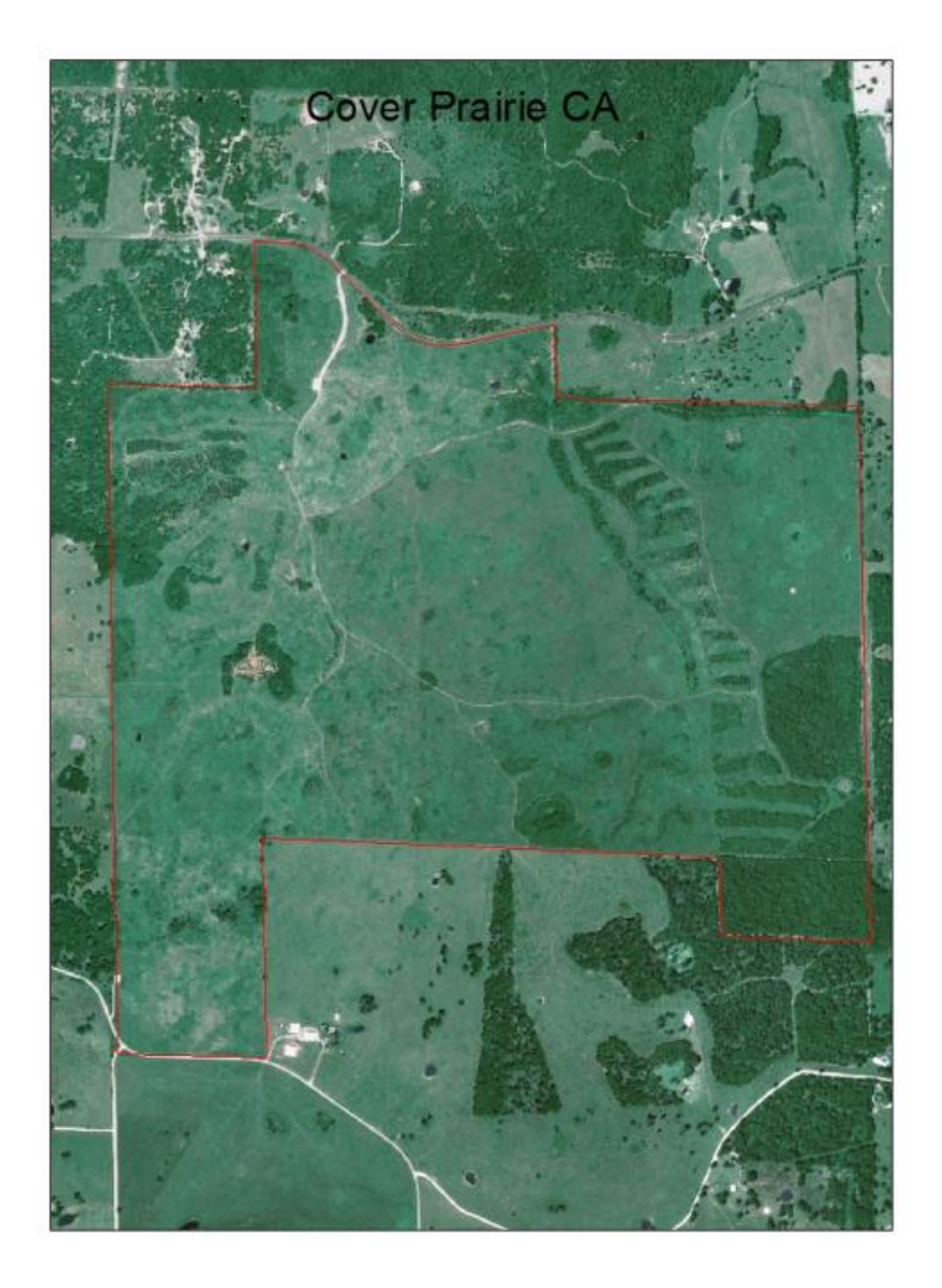
Figure 2: Aerial Map