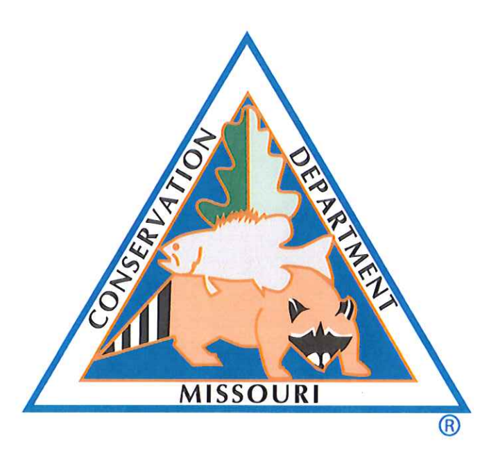
Wildlife Division Chief