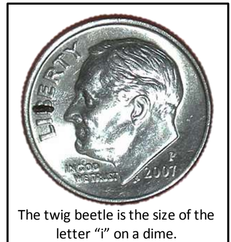
The twig beetle is the size of the letter “i” on a dime.